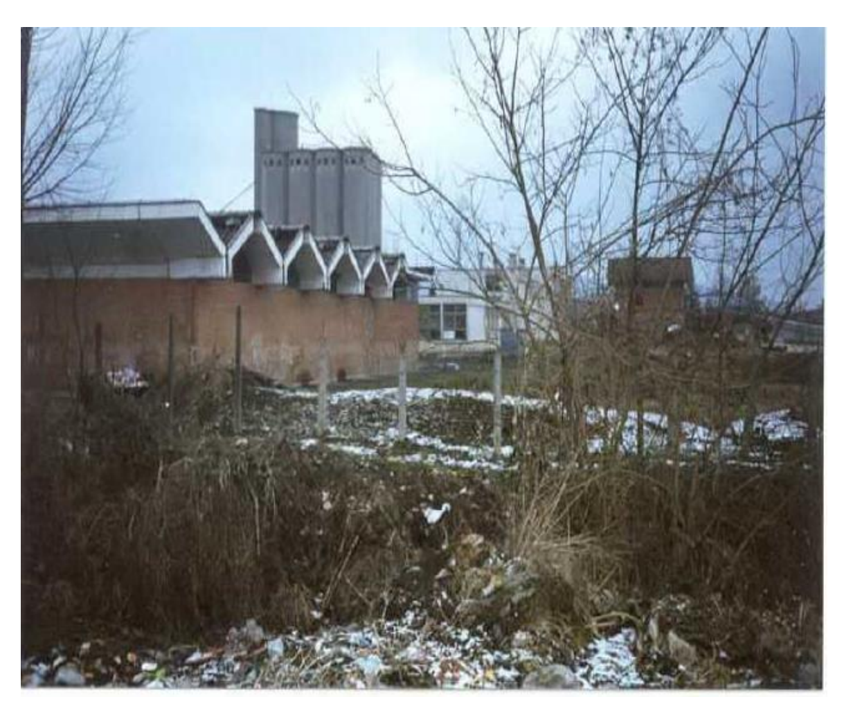
Karakaj Technical School